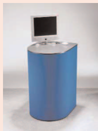
Single D Designed to add useful counter space to any display.