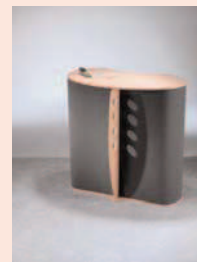
Elan Distinctive styling, Ideal workstation